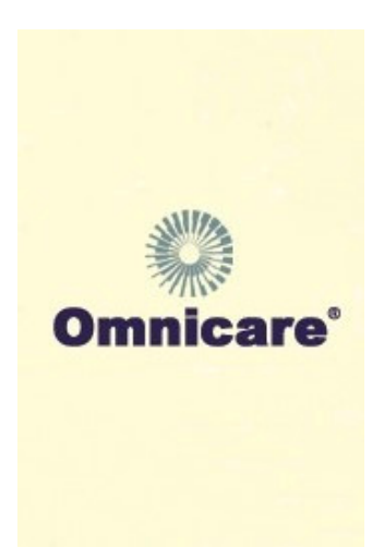
Omnicare Pharmacy of CT